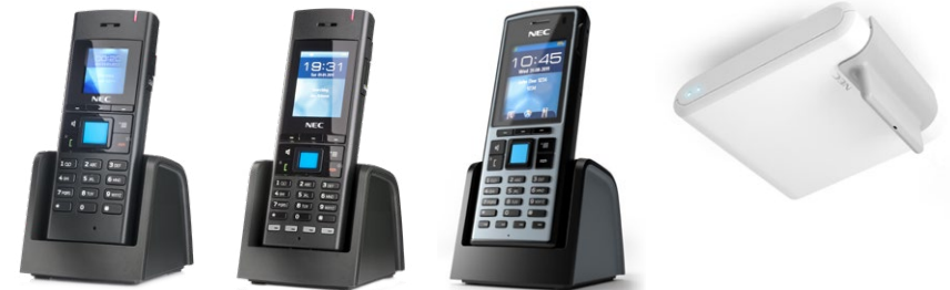
DECT handsets: for any working environment