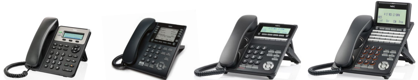
Mono: Easy call control from the office