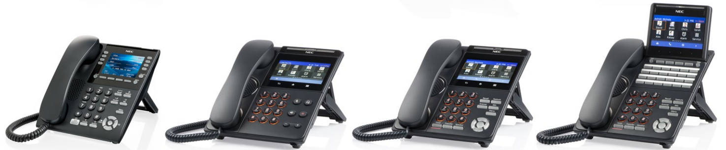
Color: Easy call control from the office, remote or home-based working, hot-desking