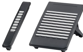
8-line Key Module / 60-line DSS Console