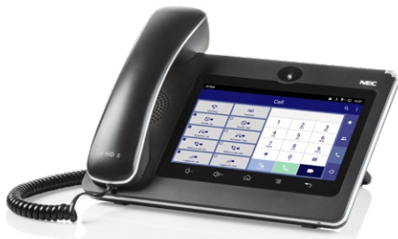
GT890: IP Desktop Video Telephone