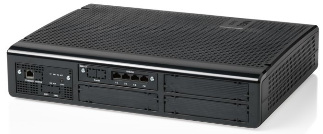
SL2100 Communication Server: Scalable from 1 to 112 users