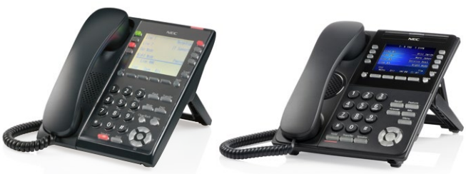
IP Telephones: Easy call control from the office, remote office or home office