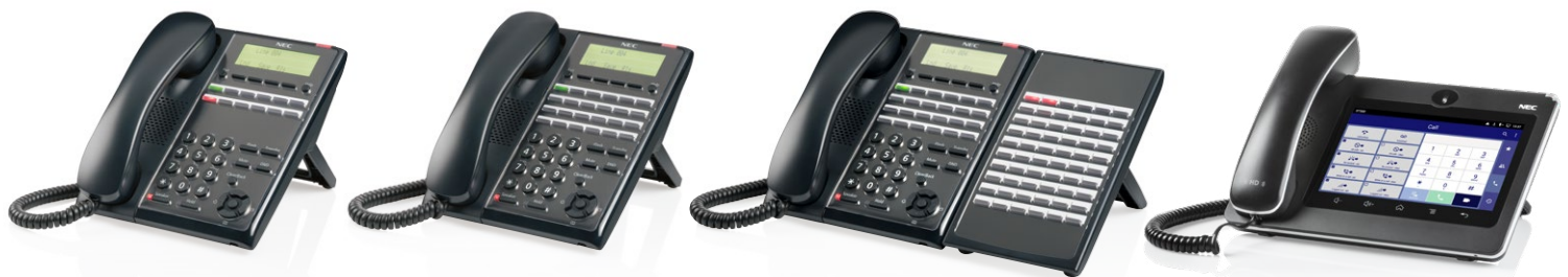
Digital Telephones: Easy control from the office