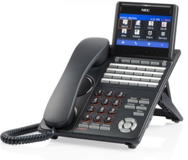
Color: Easy call control from the office, remote or home-based working, hot-desking