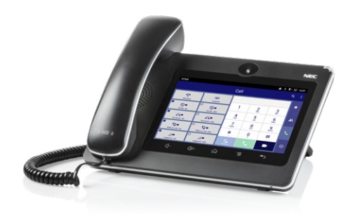
GT890: IP Desktop Video Telephone